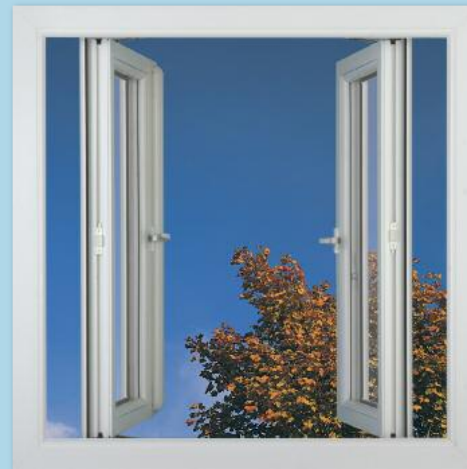
Position two: easy clean