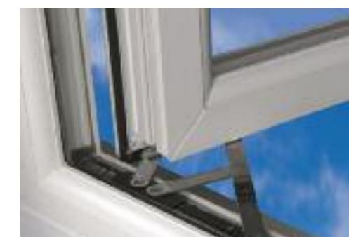
Position one: fire escape