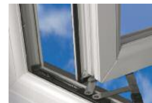
Position two: easy clean