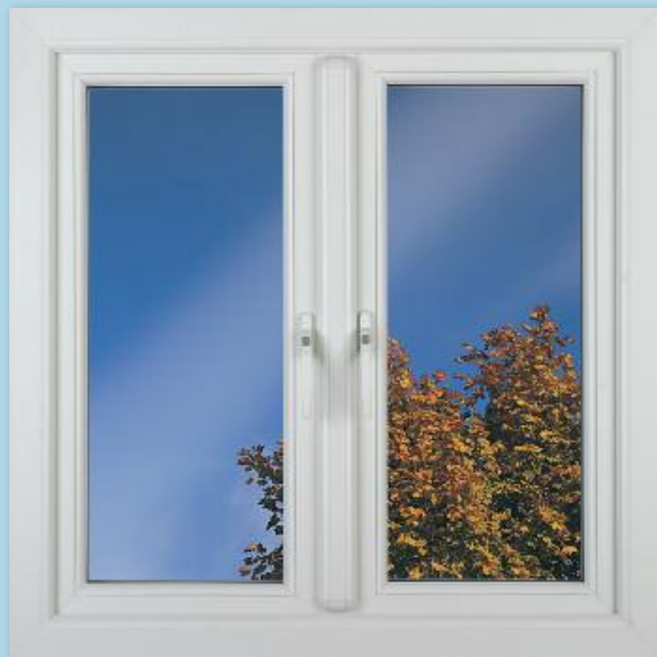
Two windows with two handles