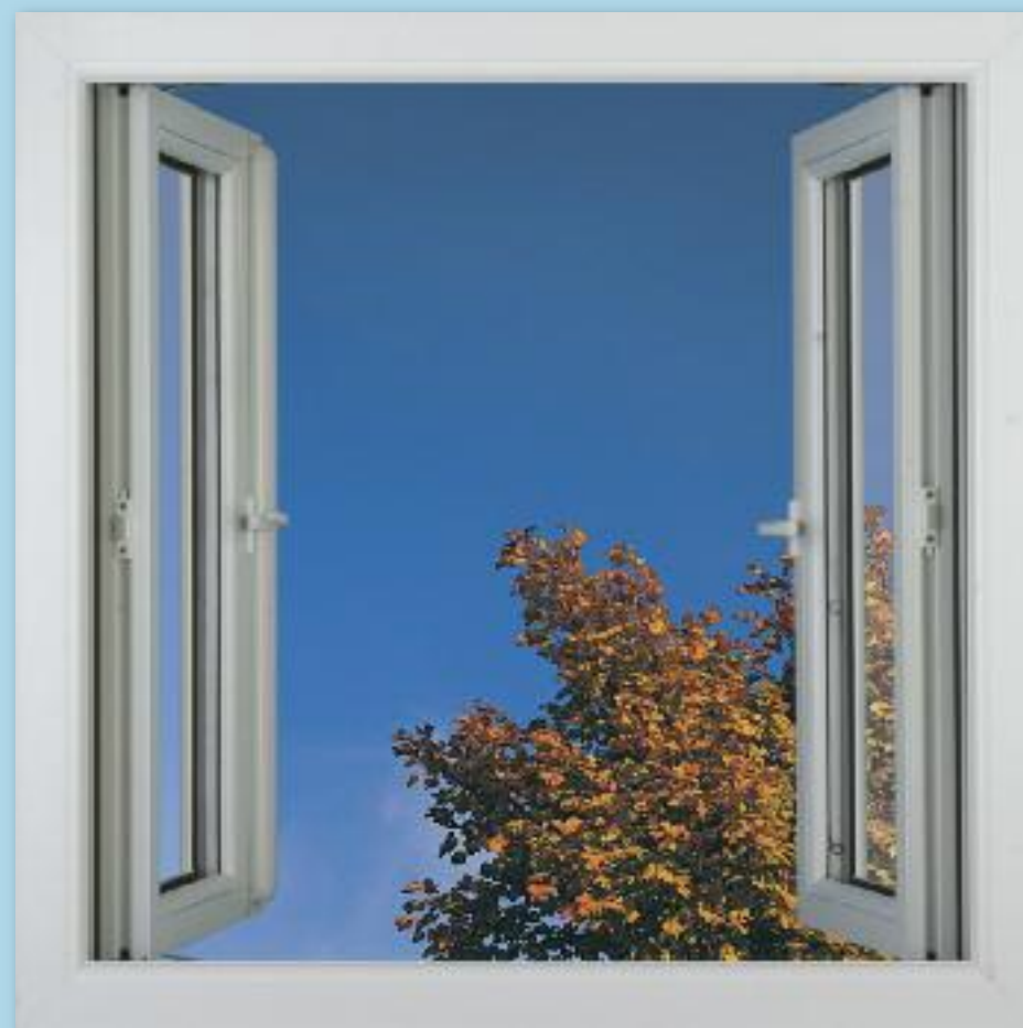
Position one: fire escape